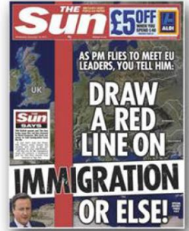
THE SUN 18 DEC 2013

How to use: Compare and contrast these newspapers. Use this Knowledge Organiser to identify the similarities and differences between the two products.