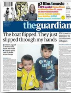
THE GUARDIAN 4 SEP 2015